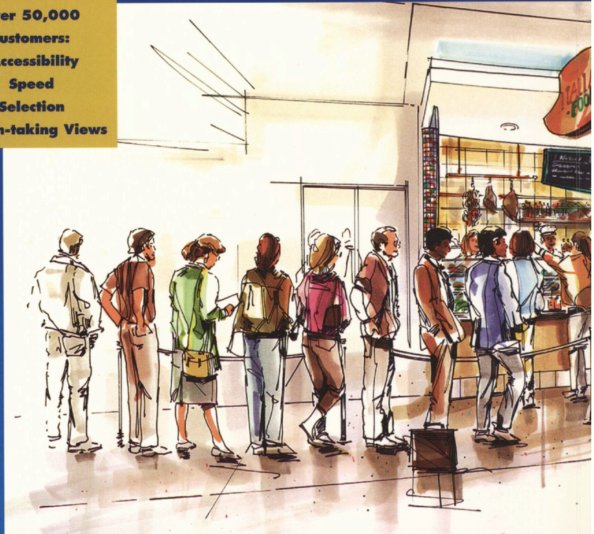
Typical service areas will have longer than normal c