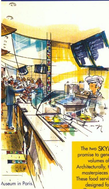
Museum in Paris.

The sheer number and variety of food service counters assures that the two SKYMARKETS™ will become THE food hubs for the Trade Center's 50,000+ daily workers.